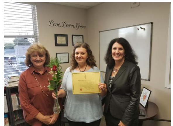
Some happy faces joining RHO!